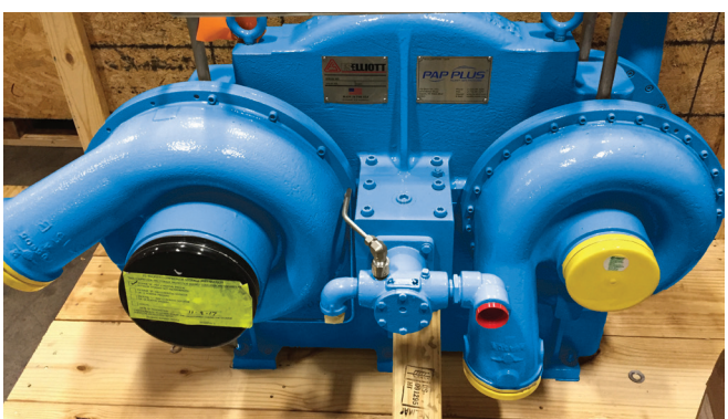
Airend before and after overhaul.